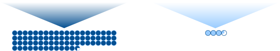
CMS Estimates of 2015 Part D Beneficiaries with High Opioid Doses and Those Who Would Have Met Revised Overutilization Monitoring Criteria Number of beneficiaries receiving high opioid doses (in tens of thousands) Estimated number of beneficiaries CMS would have tracked with revised criteria (in tens of thousands)

Source: GAO analysis of Centers for Medicare & Medicaid Service (CMS) data. | GAO-18-336T