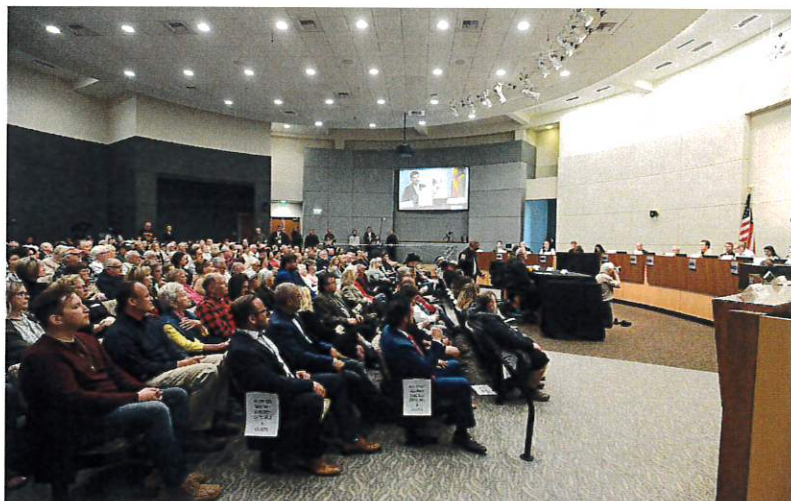
The House Judiciary Committee, led by Representative Jim Jordan, Republican of Ohio, held a field hearing in Yuma, Ariz., last month.

Two different subcommittees of the Energy and Commerce Committee scheduled two different field hearings last month in Texas, roughly 18 hours and 600 miles apart. When inclement weather tanked the lawmakers’ commercial travel plans to get to the second hearing in Midland, they ended up chartering a plane to get them there in time.